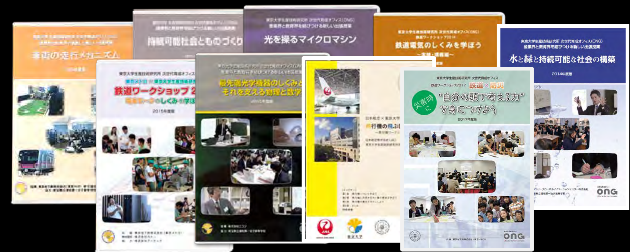
Digital teaching materials (DVD, YouTube)