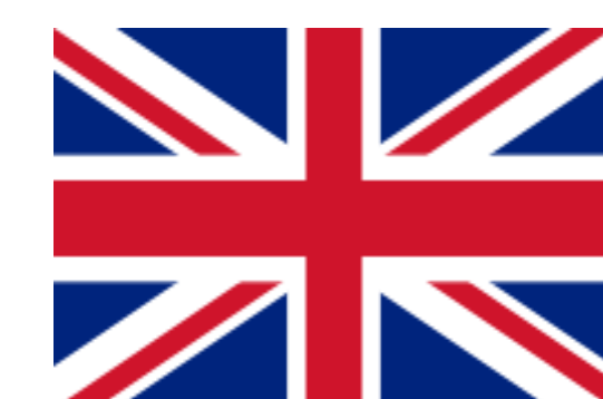
University of Southampton

Not in seeking new landscapes but in having new eyes ~ Marcel Proust