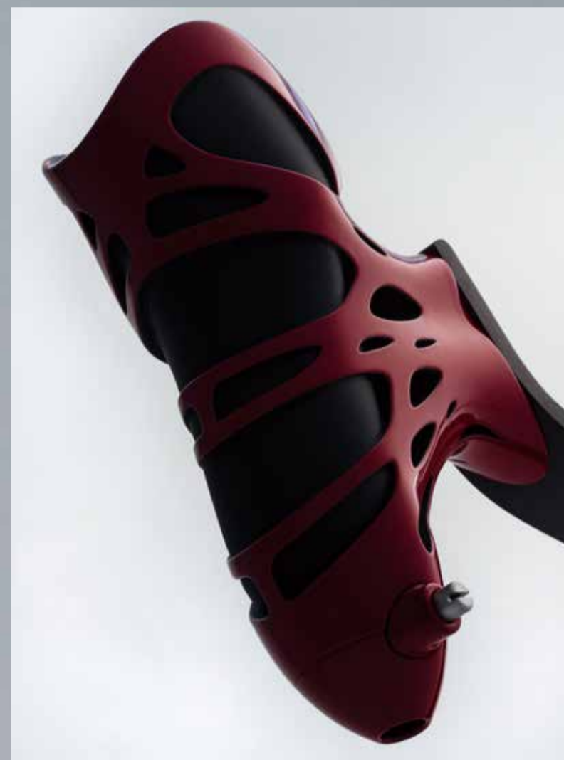
Rami : Additive Manufactured Running-specific Prosthesis