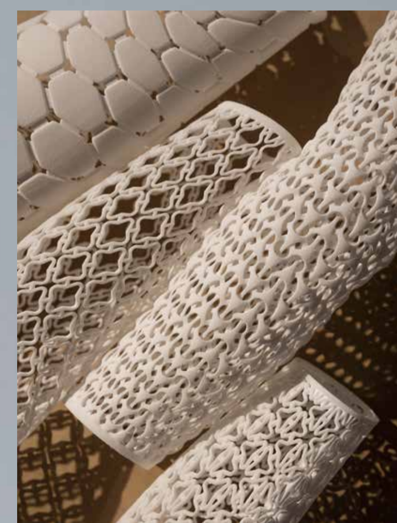
Elastic Surface : Designing elasticity using AM technology