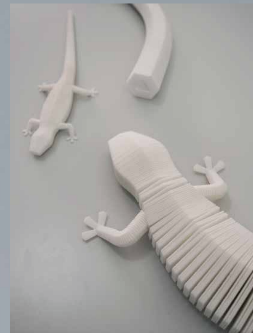
Structured Texture : Designing texture using AM technology