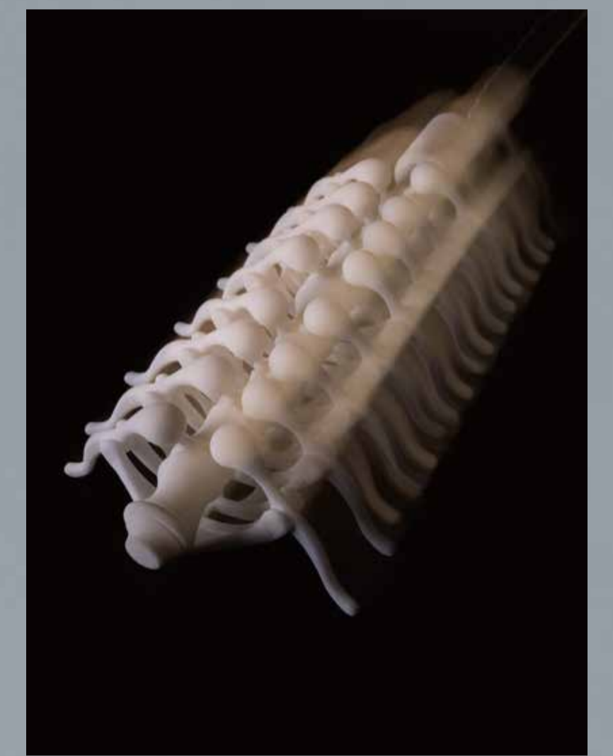
READY TO CRAWL