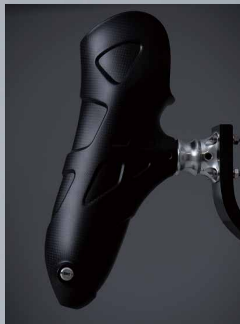
CR-1 : Running-specific prosthesis with dry carbon socket