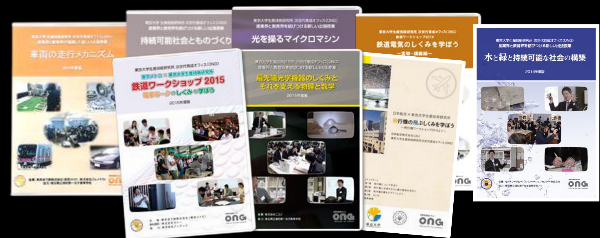
Digital teaching materials