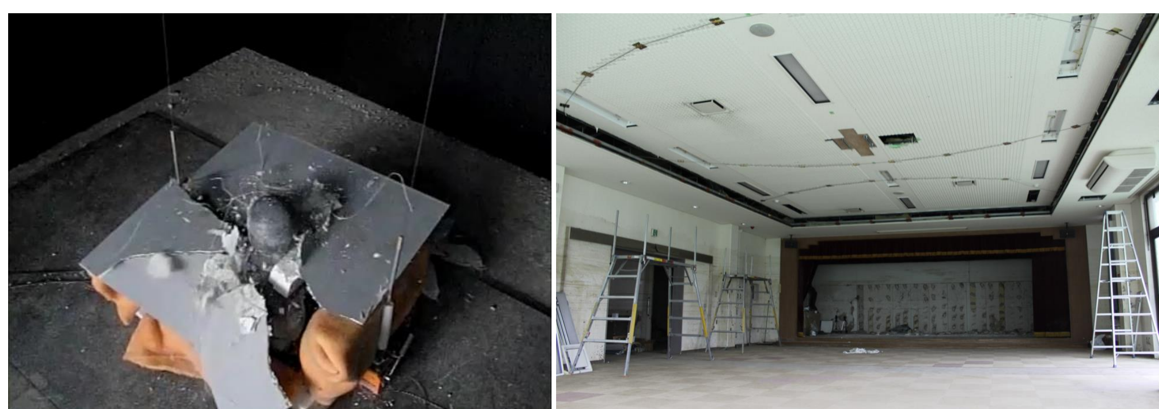
Safety assessment of ceilings by dropping experiments

We have been researching and developing various buildings which practically use advantages of spatial structure.