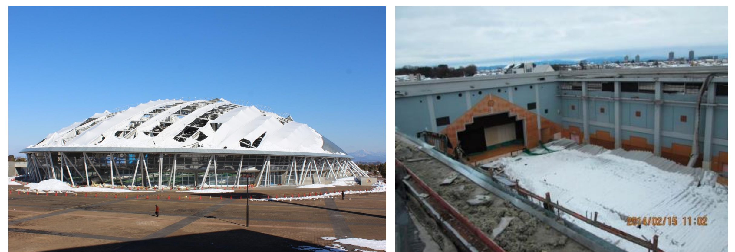
City of Fujimi http://www.city.fujimi.saitama.jp/40shisei/04gyouseizaisei/shingikai/files/tyousa-siryou4-2.pdf (Apr. 15, 2014)