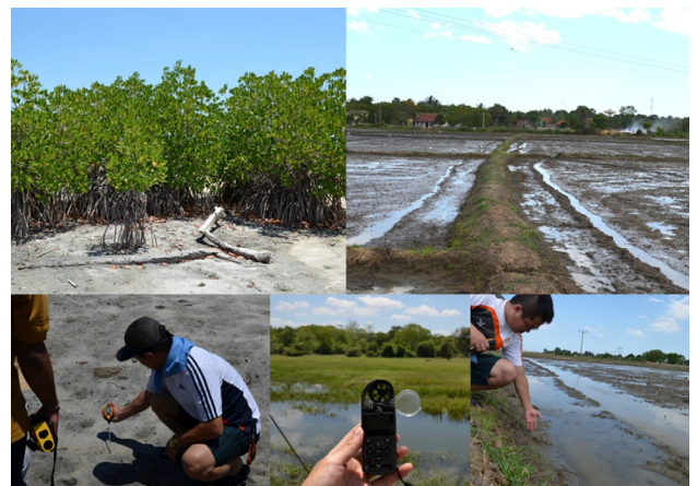
Fig.3 Field survey of mangrove and paddy field in Sri Lanka