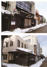
Examples of partial renovations

Keeping these in mind, by using timber as much as possible to build recovery public housing and municipal halls and to partially renovate existing buildings along the Oshu-Kaido, we would like to call out to people in Yabuki for creation of "wooden townscape by new vocabulary".