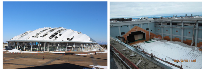
City of Fujimi http://www.city.fujimi.saitama.jp/40shisei/04gyouseizaisei/shingikai/files/tyousa-siryou4-2.pdf (Apr. 15, 2014)