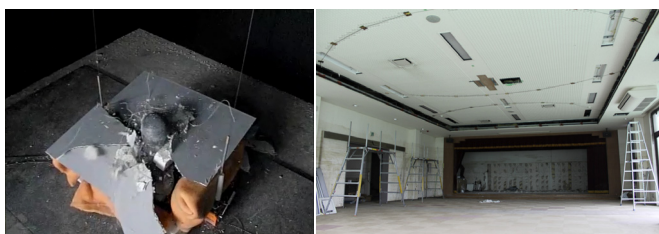
Safety assessment of ceilings by dropping experiments

We have been researching and developing various buildings which practically use advantages of spatial structure.