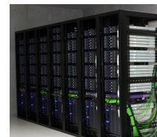
Cloud Computing environment that has more than 1800 cores

Cloud computing -- large-scale on-demand distributed computing environment -- has become very popular. We are trying to develop a new technology to construct cloud applications with dynamic load balancing and fault resilience. Large-scale search problems have some difficulty to apply these techniques, therefore we're focusing on distributed computing platform to develop such applications with ease.