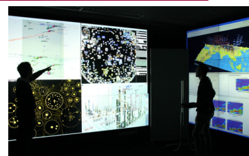
Huge-scale spatio-temporal visualization system on the display wall

Our lab has continuously collected Japanese Web pages since 1999 and has constructed a Web archive system including about 30 billion pages, 1 billion blog articles, and 16 billion tweets. Based on this peta scale archive, we are developing structural, contents, and temporal analysis systems including information diffusion extraction, inter-media comparison, and realtime deep text analysis. Results of analysis can be interactively visualized on a large-scale high-resolution display wall.