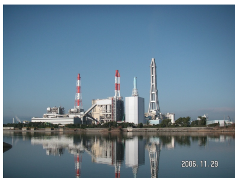
Integrated coal Gasification Combined Cycle (IGCC)